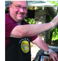
Wisconsin “Street Food Row”