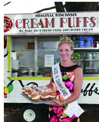
“Alice in Dairyland”

Wisconsin “Street Food Row” and Beverage Sales Shelter overlooking the river