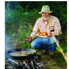
Eagle River Guides Association “Fish Shore Lunch Sampling” with “Yukon Jack”