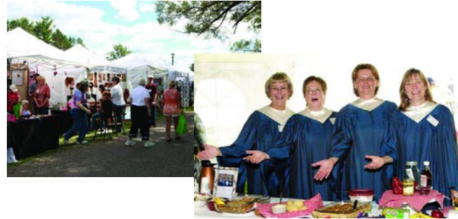
“Heavenly Hostesses” – Past Winners Wisconsin Church Basement Supper Contest

Festival of Flavors Art & Craft Show, north of Riverview Park Sat. 9 a.m.-4 p.m.; Sun., 10 a.m.-3 p.m.